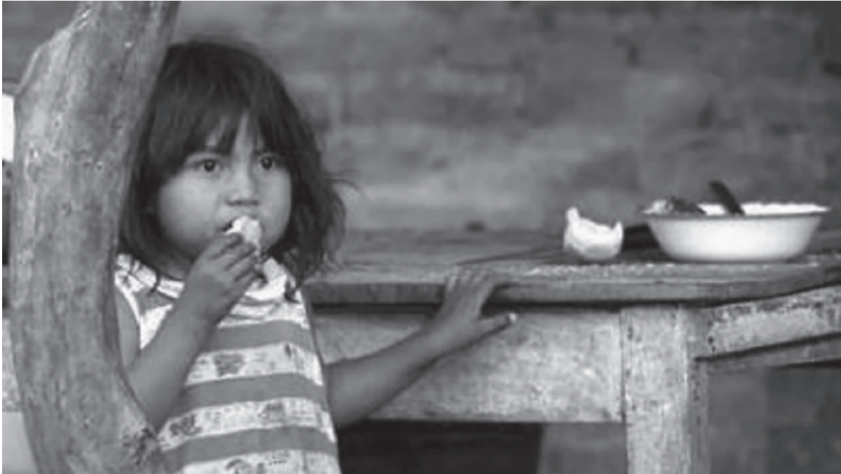
Indonesian child eating white bread