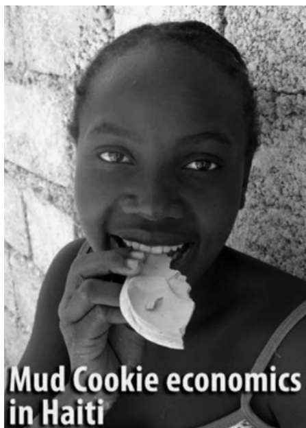
Young woman eating a mud cookie in Haiti which imports most of its food, leaving many Haitians hungry due to food price increases

There are three types of food aid: program aid, project aid, and emergency aid. Program aid is not really food aid, but cheap food sales that allow a recipient country to reduce its trade deficit while helping the donors (including