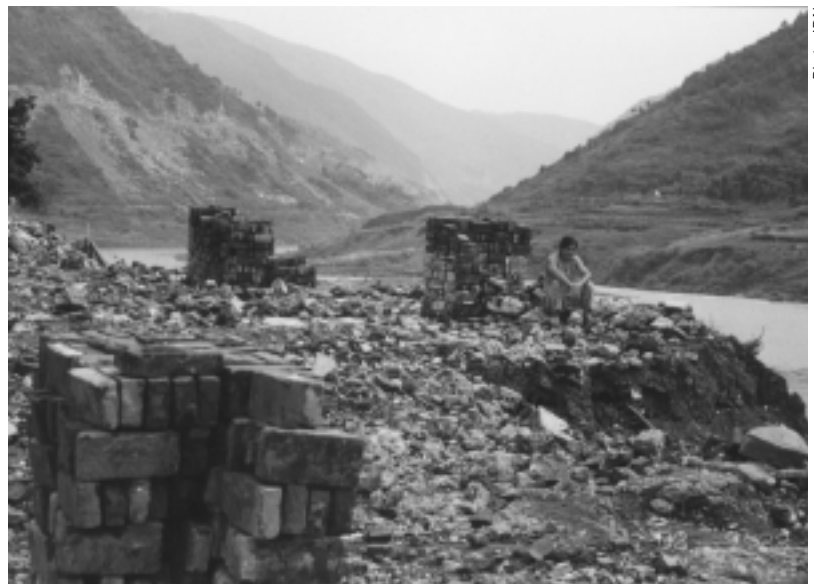
A worker sits on the ruins of a demolished building in an area to be flooded by the Three Gorges Dam reservoir.

While movements for global justice have succeeded in generating public debate about other previously anonymous institutions, such as the World Bank, the World Trade Organization (WTO), and the International Monetary Fund (IMF), one big piece has been missing from our understanding of how the global economic system favors multinational corporations and banks from rich countries over the poor and the environment in developing countries. That missing piece is the role of export credit agencies. "ECA" must be the next international acronym dragged into the public light.